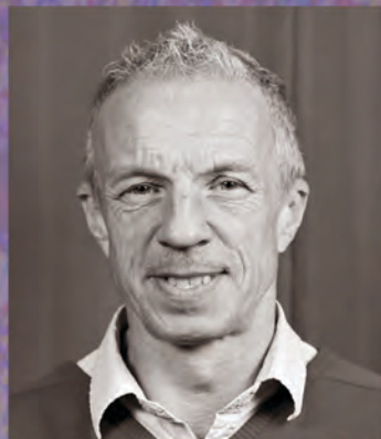
Terry Bunton King Louis XI