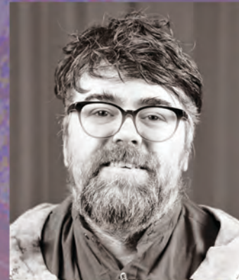
Pav Stone St Aphrodisius