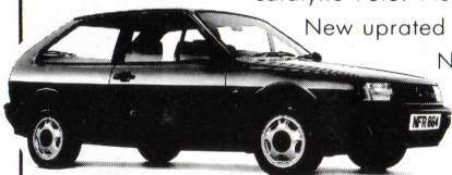
NEW CATALYTIC POLO

Talking of which, let's not forget that trusty favourite, the Golf.